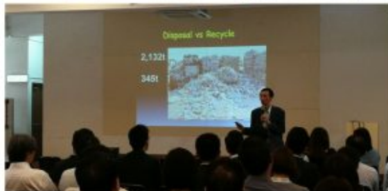
KPMG, Swire Properties